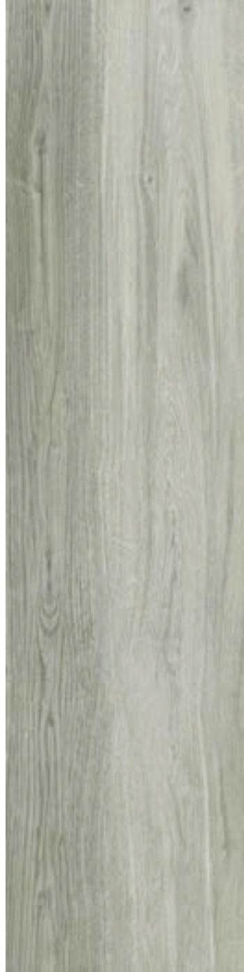
20 x 80 cm (8 x 32) VE.AQ.CIR.0832