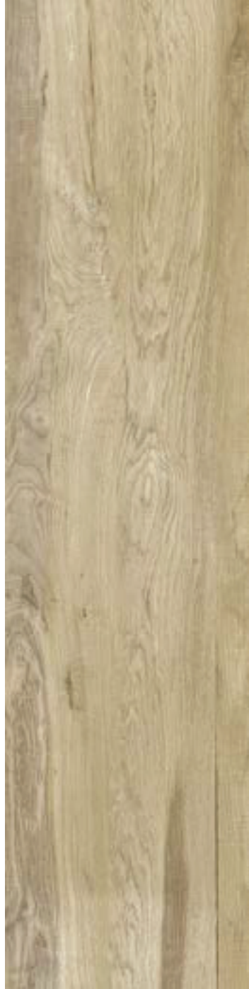
20 x 80 cm (8 x 32) VE.AQ.TUR.0832