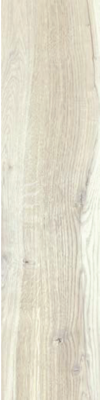
20 x 80 cm (8 x 32) VE.AQ.NIX.0832