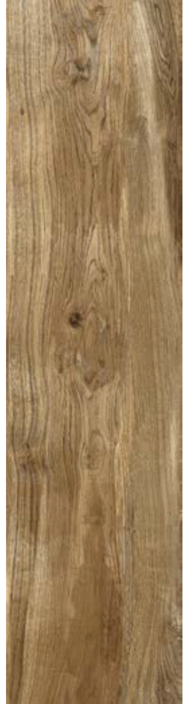
20 x 80 cm (8 x 32) VE.AQ.CAS.0832

Not all items shown in this document are a part of Alpha Tile's stocking program and are pulled from Olympia Tile. For special orders please contact your Alpha Tile Sales Representative.