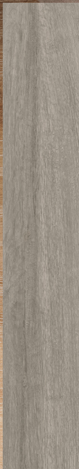
GRIS (Grey) Matte