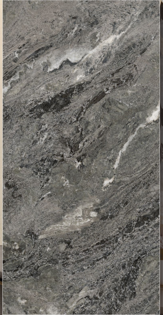
SPACE Brushed Finish

60 x 120 cm (24" x 48") BC.CO.HVN.2448.BD