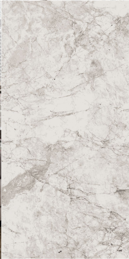
STONE WHITE Brushed Finish

60 x 60 cm (24" x 24") BC.CO.STW.2424.BD