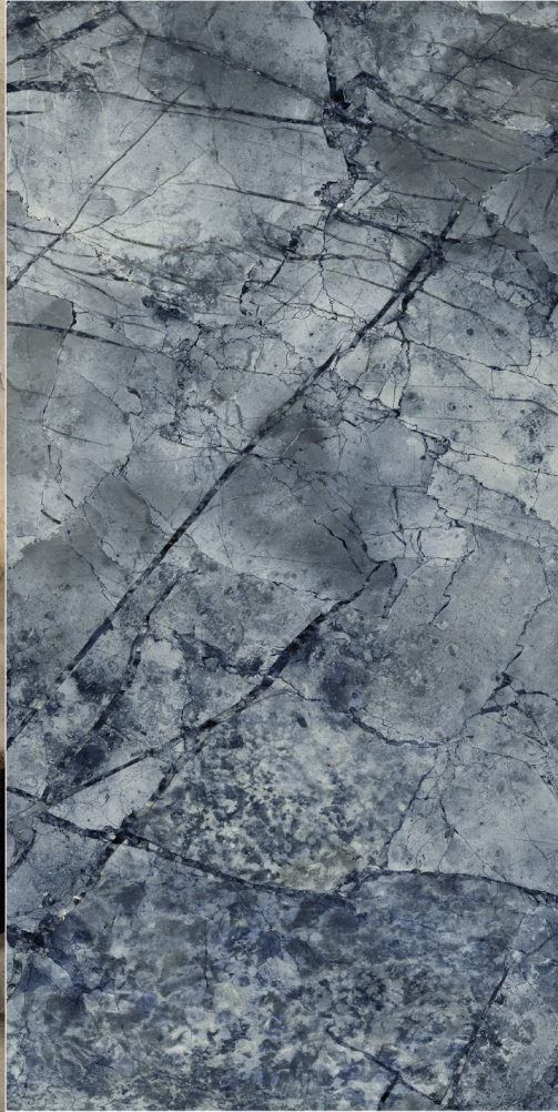
HEAVEN Brushed Finish

60 x 60 cm (24" x 24") BC.CO.HVN.2424.BD