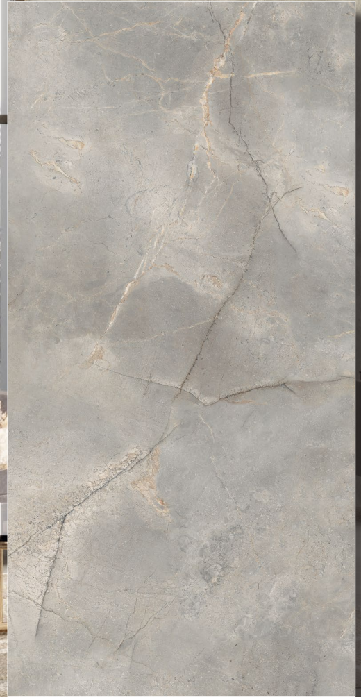
MYSTIC Brushed Finish

60 x 120 cm (24" x 48") BC.CO.STW.2448.BD