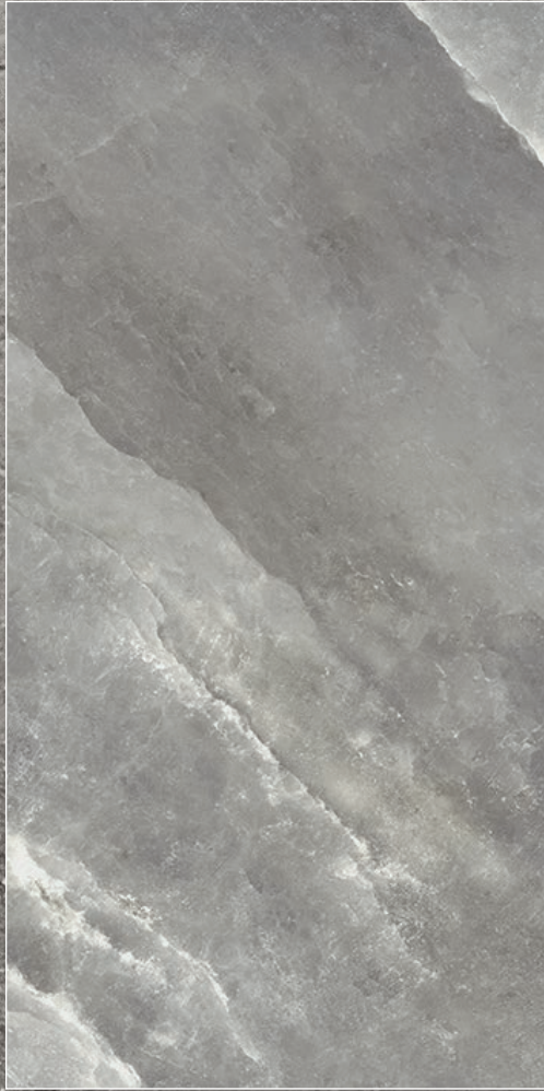
GREY Matte Finish

60 x 60 cm (24" x 24") NM.CS.GRY.2424.MT