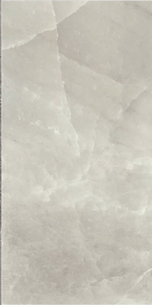
WHITE Matte Finish

60 x 60 cm (24" x 24") NM.CS.WHT.2424.MT