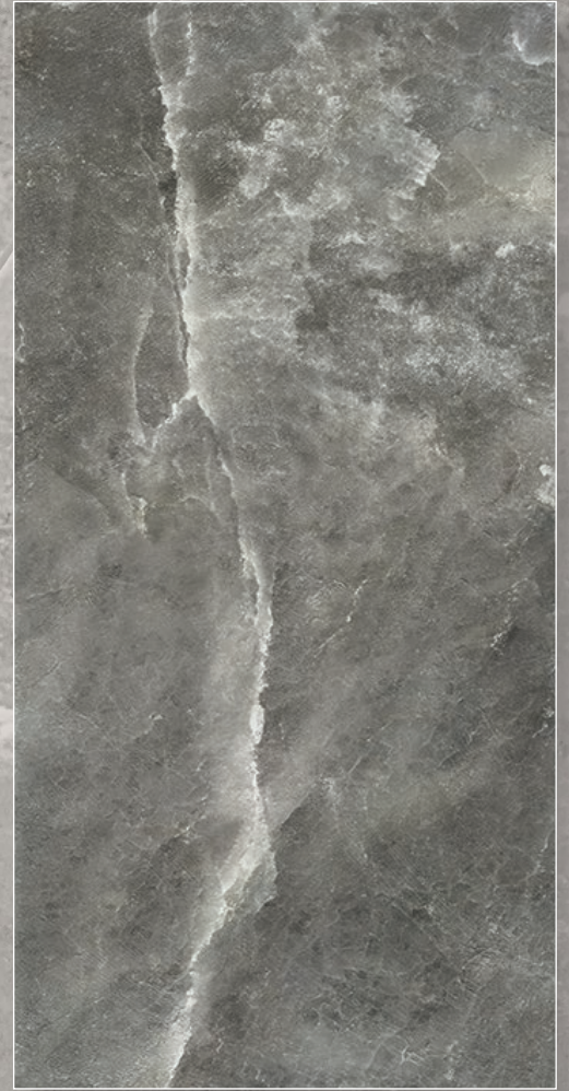
SMOKE Matte Finish

60 x 120 cm (24" x 48") NM.CS.GRY.2448.MT