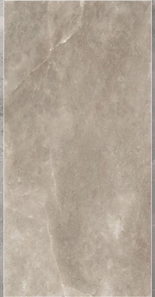
DOVE Matte Finish

60 x 120 cm (24" x 48") NM.CS.WHT.2448.MT