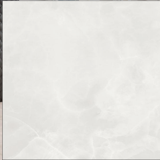
ONYX (White) Kerlite Exedra 40" x 40" Polished XD.EX.ONX.4040.PL