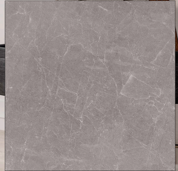
RAIN GREY Kerlite Exedra 40" x 40" Polished XD.EX.RNY.4040.PL