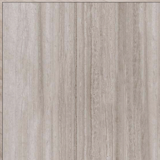
RIVERSTONE Kerlite Exedra 40" x 40" Polished XD.EX.RRS.4040.PL

This series is a coloured-base porcelain of VERY THIN tiles with a fiberglass backing. The fibreglass backing provides cracking resistance, allows application in any situation (including 3-dimensional applications). With the fibreglass backing, Kerlite can also be scored and wrapped around a pillar or over a table top.