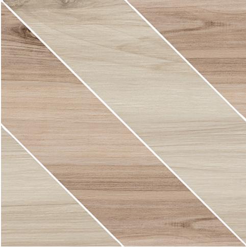
20 x 20 cm (7.8 x 7.8) KM.KR.APP/PCH.LN.DC