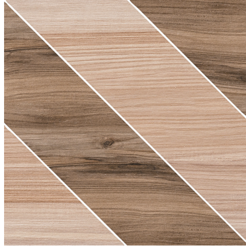
20 x 20 cm (7.8 x 7.8) KM.KR.APR/NUT.LN.DC

Not all items shown in this document are a part of Alpha's stocking program and are pulled from Olympia Tile. For special orders please contact you Alpha Tile Sales Representative.