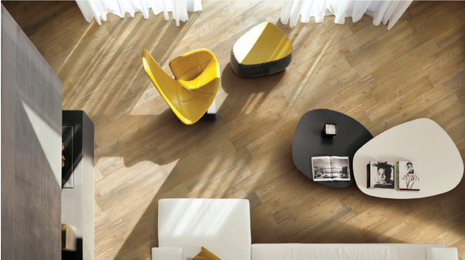
FRESH (LIGHT GOLD)