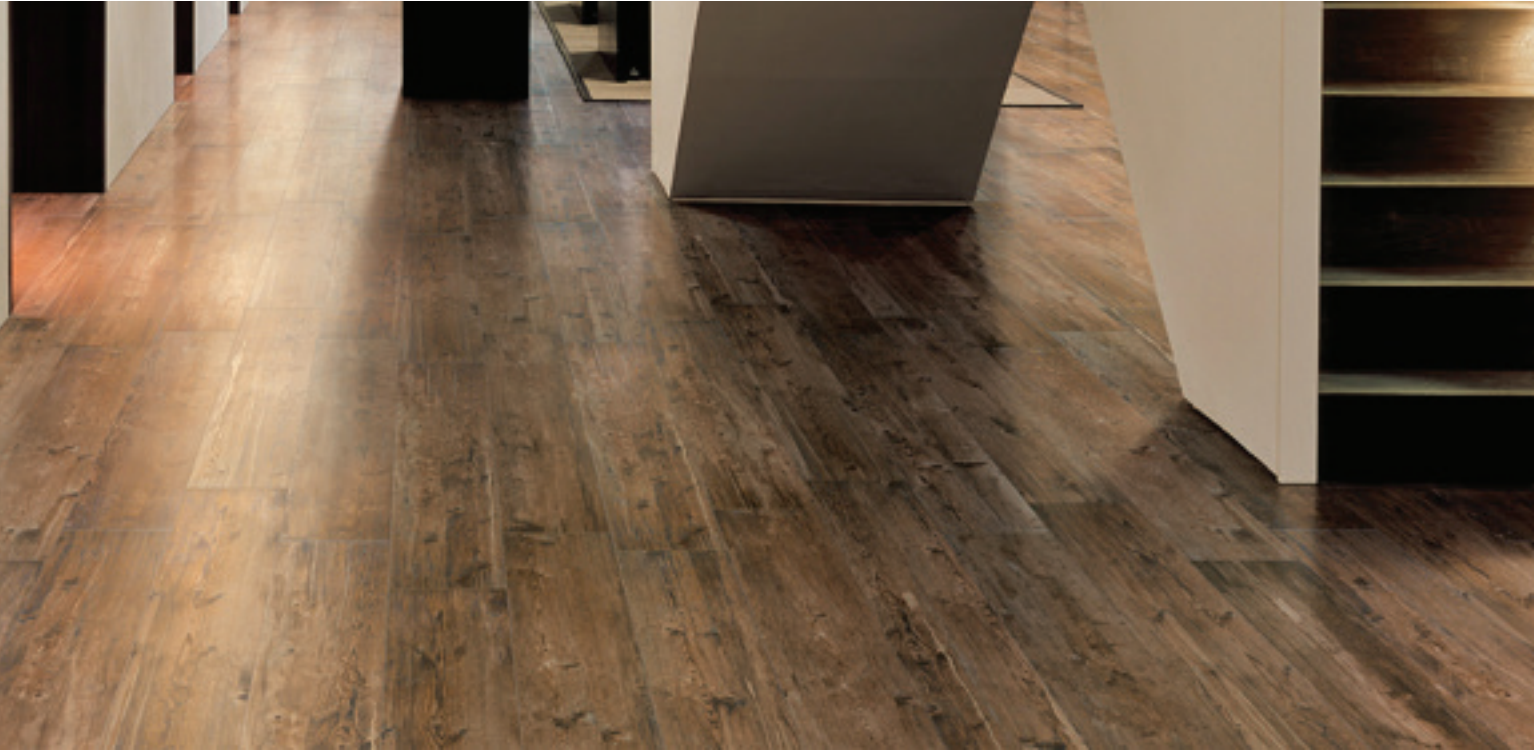
SUN (DARK BEIGE)