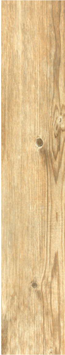
FRESH (LIGHT GOLD)