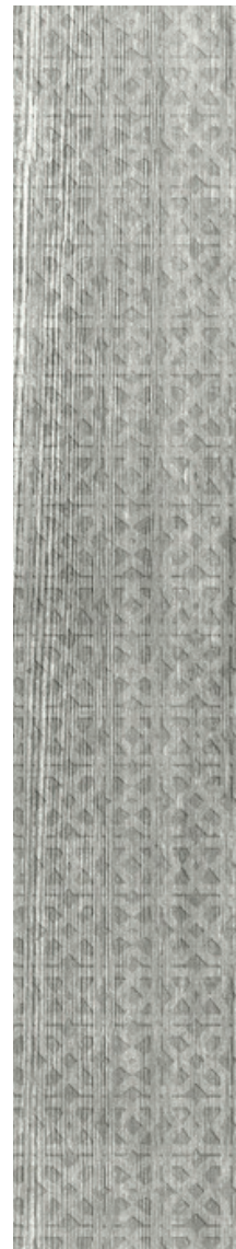
SHADE DECOR (GREY)