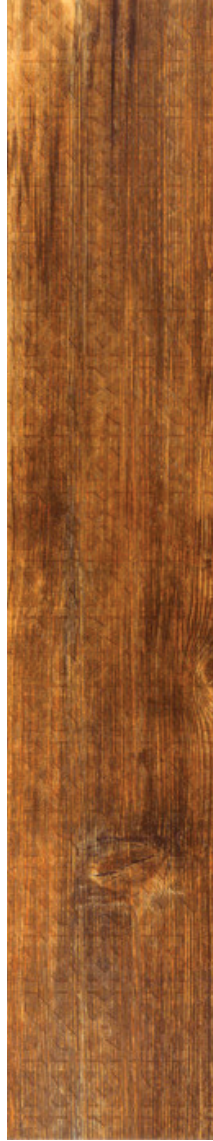
SUN DECOR (DARK BEIGE)