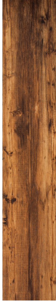
SUN (DARK BEIGE)