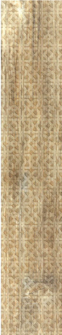
NATURAL DECOR (BEIGE)