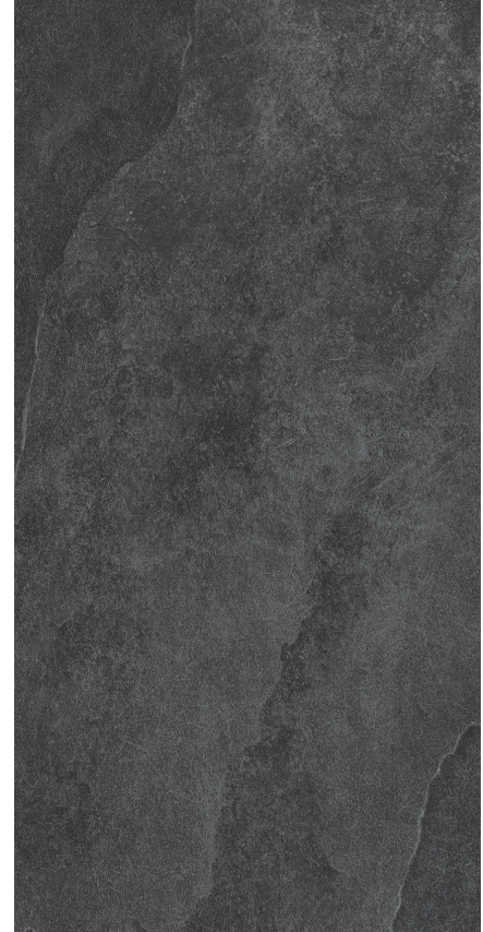
30 x 60 cm (11.82 x 23.63) EX.LP.ANT.1224.MT

All items shown in this document are a part of Alpha's stocking program. For special orders please contact your Alpha Tile Sales Representative