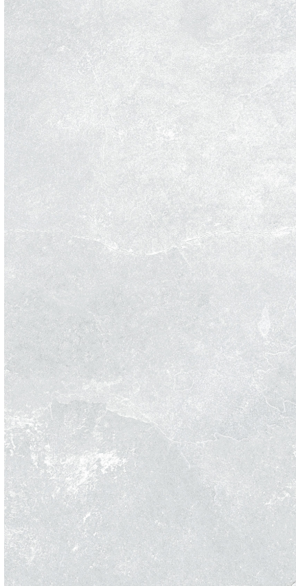
30 x 60 cm (11.82 x 23.63) EX.LP.WHT.1224.MT EX.LP.WHT.2020.MT