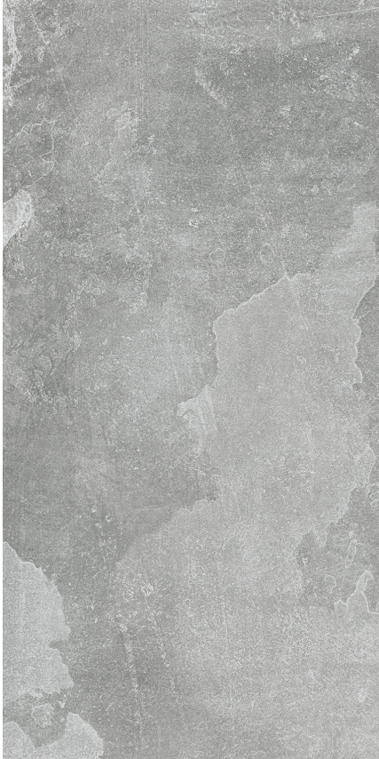
30 x 60 cm (11.82 x 23.63) EX.LP.GRY.1224.MT EX.LP.GRY.2020.MT