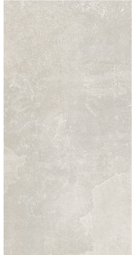
30 x 60 cm (11.82 x 23.63) EX.LP.BGE.1224.MT EX.LP.BGE.2020.MT

All items shown in this document are a part of Alpha's stocking program. For special orders please contact your Alpha Tile Sales Representative