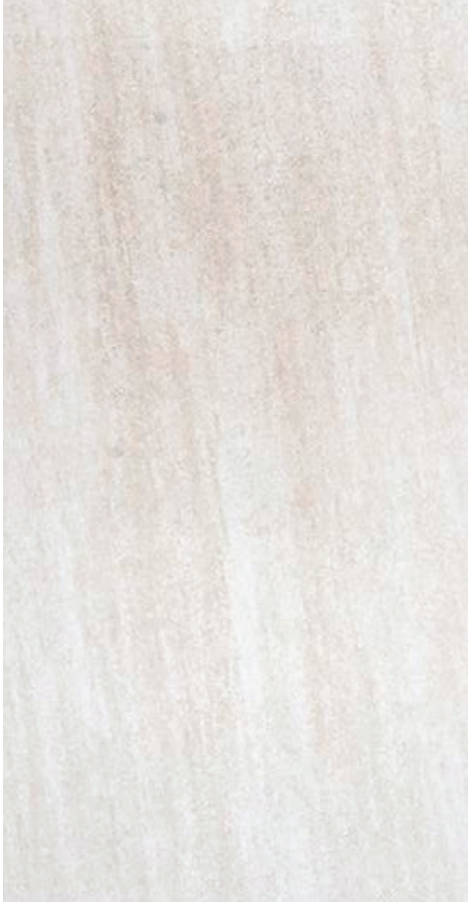
12 x 24 UI.LD.BIA.1224