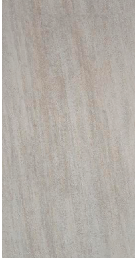
12 x 24 UI.LD.BGE.1224

All items shown in this document are a part of Alpha's stocking program. For special orders please contact your Alpha Tile Sales Representative