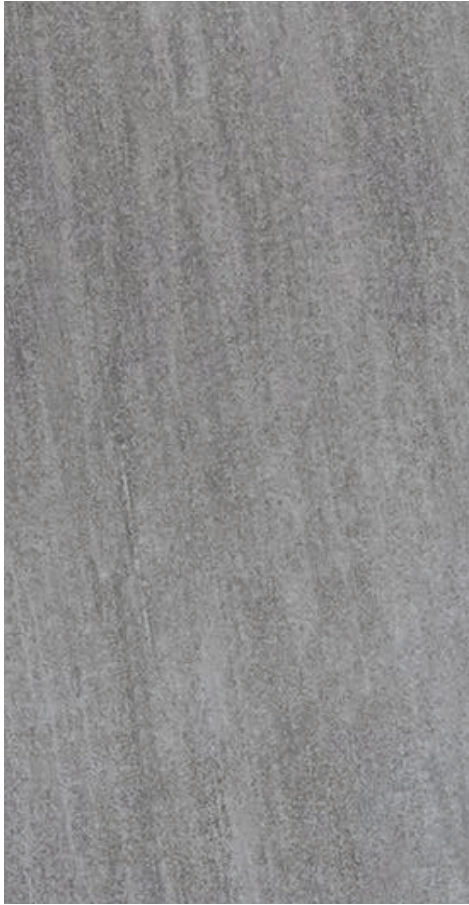
12 x 24 UI.LD.GRG.1224