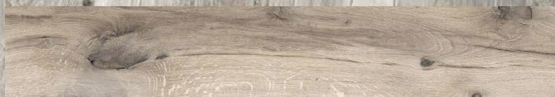
CENERE 3 x 18 Matte RD.LV.CNR.0318