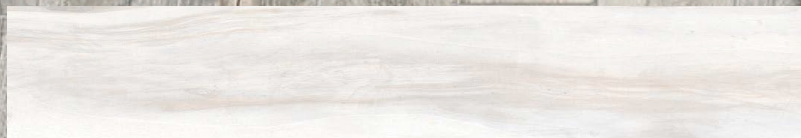
BIANCO 3 x 18 Matte RD.LV.BIA.0318