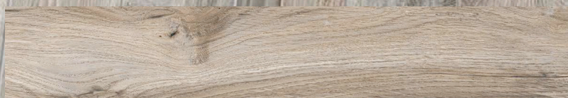
TORTORA (Warm Grey) 3 x 18 Matte RD.LV.TTA.0318