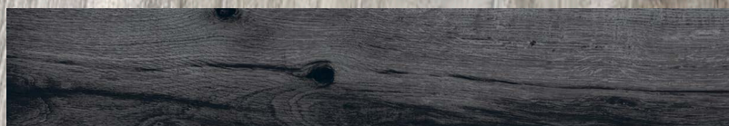
NERO 3 x 18 Matte RD.LV.NRO.0318