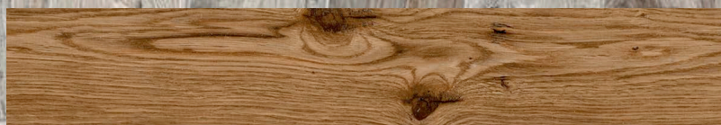
NOCE 3 x 18 Matte RD.LV.NCE.0318