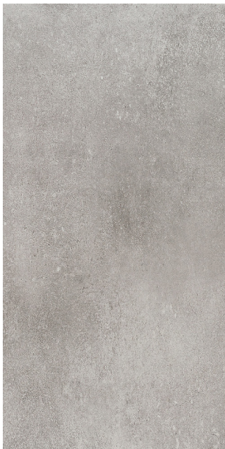
30 x 60 cm (12 x 24) MZ.MM.SIL.1224