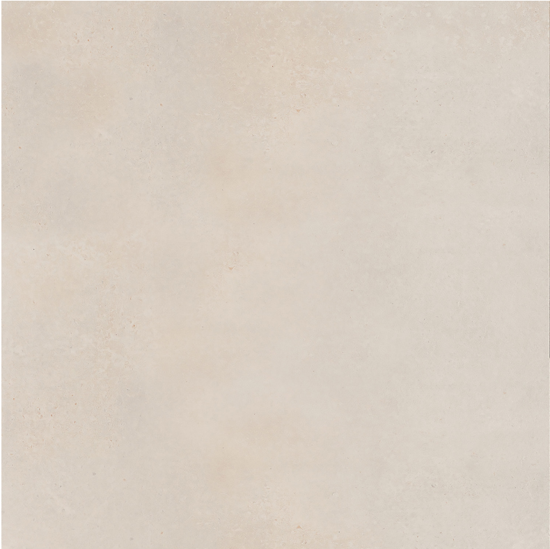
75 x 75 cm (30 x 30) MZ.MM.OLW.3030

All items shown in this document are part of Olympia's stocking program. For special orders, please contact your Olympia Tile Sales Representative.