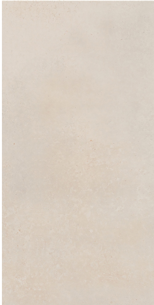
30 x 60 cm (12 x 24) MZ.MM.OLW.1224