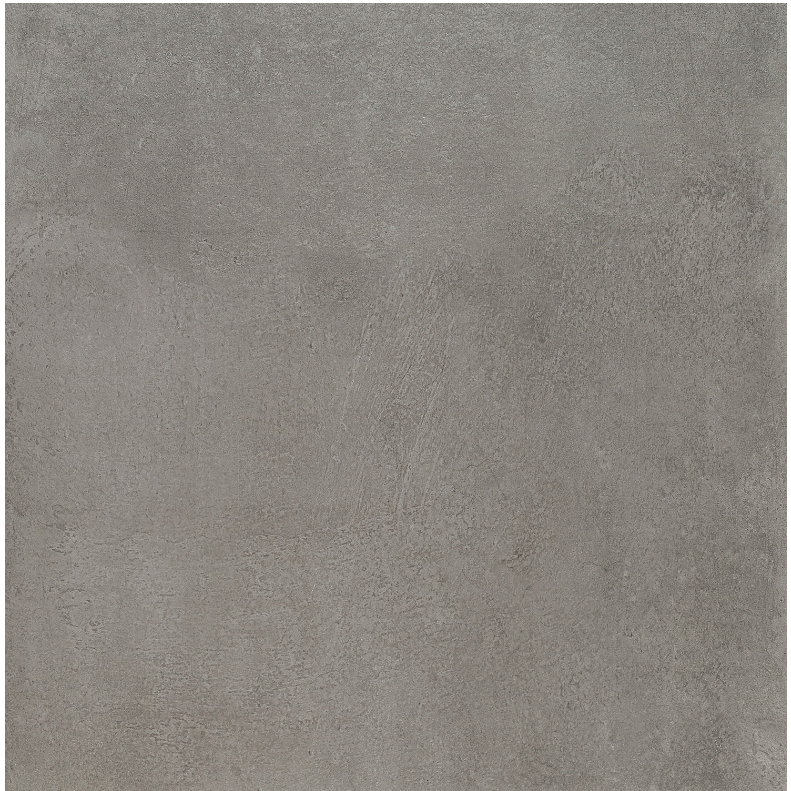
75 x 75 cm (30 x 30) MZ.MM.MER.3030

All items shown in this document are part of Olympia's stocking program. For special orders, please contact your Olympia Tile Sales Representative.