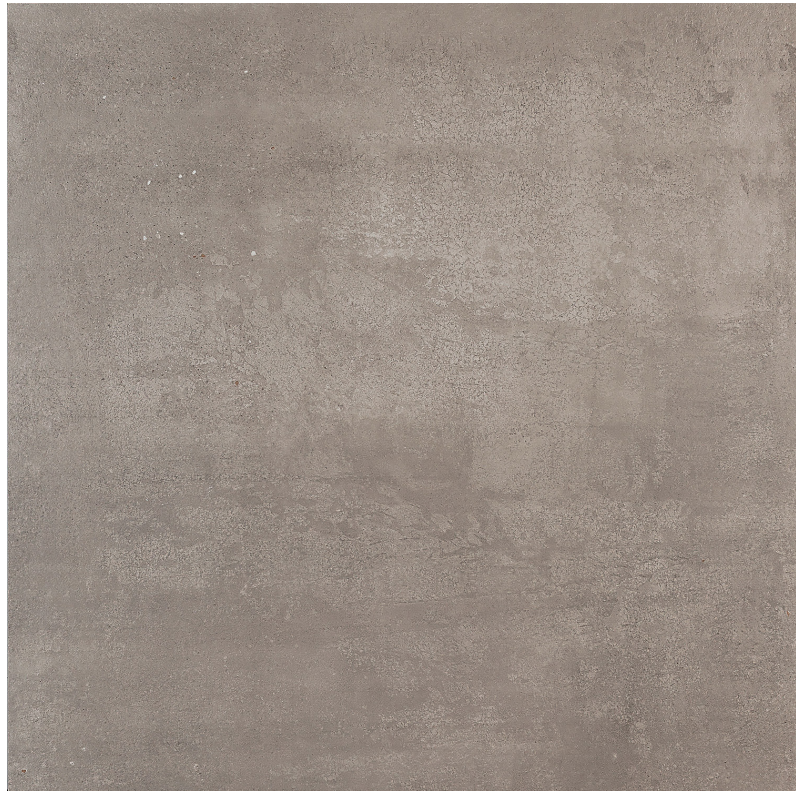
75 x 75 cm (30 x 30) MZ.MM.TPE.3030

All items shown in this document are part of Olympia's stocking program. For special orders, please contact your Olympia Tile Sales Representative.