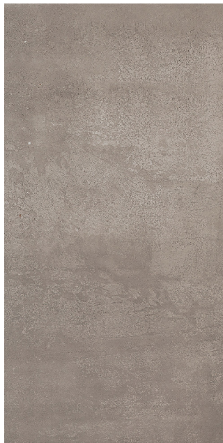
30 x 60 cm (12 x 24) MZ.MM.TPE.1224