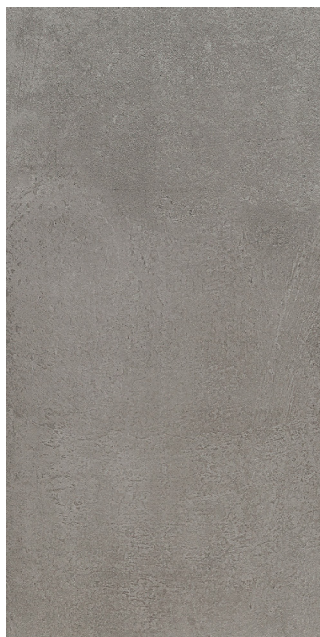
30 x 60 cm (12 x 24) MZ.MM.MER.1224