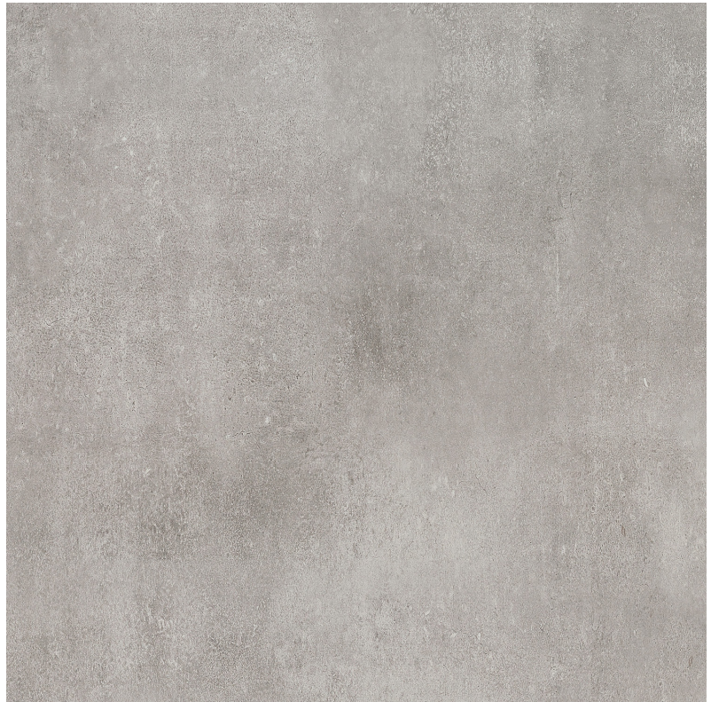
75 x 75 cm (30 x 30) MZ.MM.SIL.3030

All items shown in this document are part of Olympia's stocking program. For special orders, please contact your Olympia Tile Sales Representative.