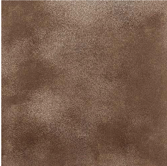
60 x 60 cm (24 x 24) Structured Finish WI.MG.BRZ.2424.ST