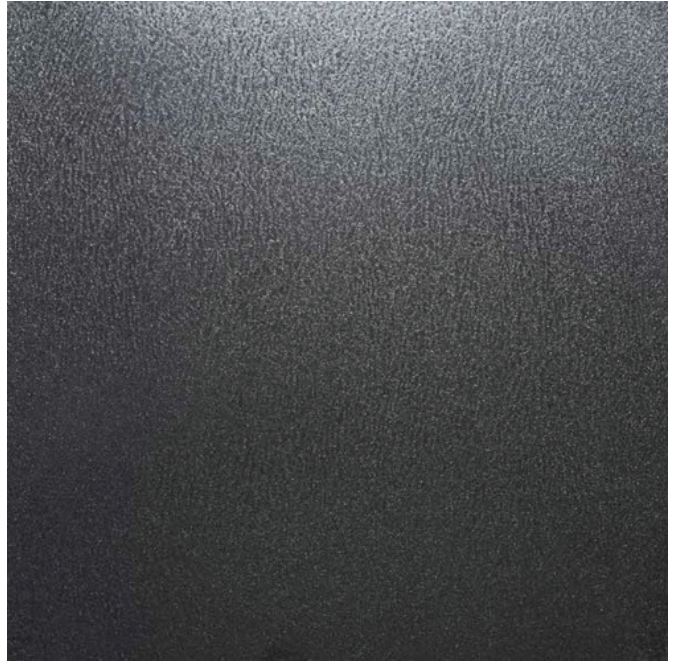
60 x 60 cm (24 x 24) Structured Finish WI.MG.TTM.2424.ST

Not all items shown in this document are part of Alpha's stocking program, and are pulled from Olympia Tile. For special orders please contact your Alpha Tile Representative.