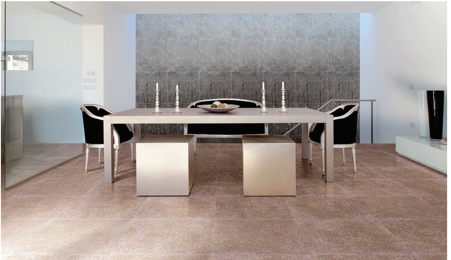
Bronze & Platinum