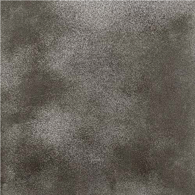
60 x 60 cm (24 x 24) Structured Finish WI.MG.PLT.2424.ST

Not all items shown in this document are part of Alpha's stocking program, and are pulled from Olympia Tile. For special orders please contact your Alpha Tile Representative.