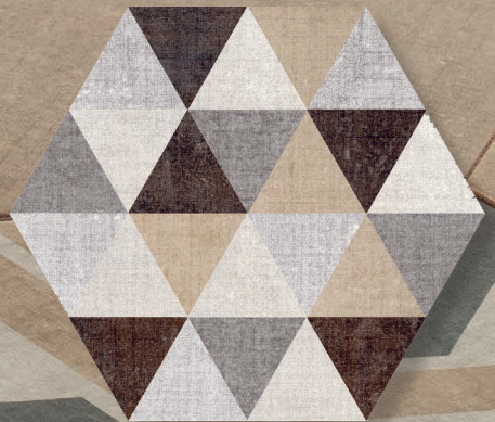
TRIANGLE DECOR MIX

25 cm (10") Hexagon Code # MC.MR.DRK.10.HEX