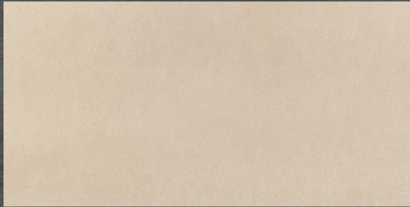
ALMOND Matte 12"x24" Rectified IM.M2.ALM.1224