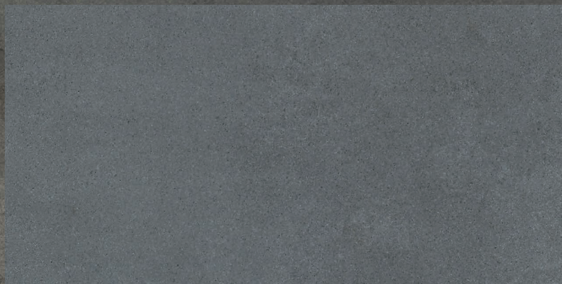
ANTHRACITE Matte 12"x24" Rectified IM.M2.ATR.1224

Not all items shown in this document are a part of Alpha Tile's stocking program and are pulled from Olympia Tile. For special orders please contact your Alpha Tile Sales Representative.