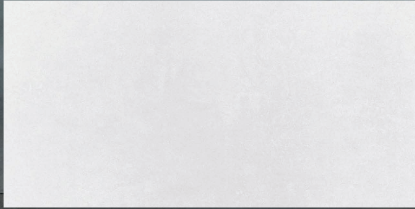
WHITE Matte 12"x24" Rectified IM.M2.WHT.1224