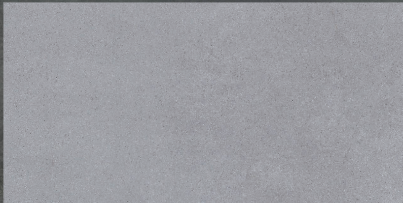
DARK GREY Matte 12"x24" Rectified IM.M2.DGR.1224