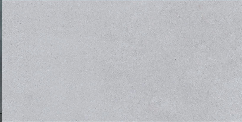
LIGHT GREY Matte 12"x24" Rectified IM.M2.LGR.1224