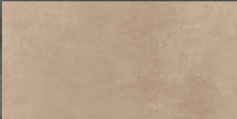
BEIGE Matte 12"x24" Rectified IM.M2.BGE.1224

Not all items shown in this document are a part of Alpha Tile's stocking program and are pulled from Olympia Tile. For special orders please contact your Alpha Tile Sales Representative.