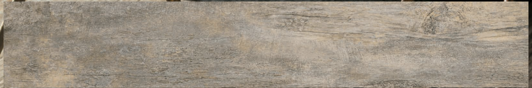
HONEY (Beige) 8" x 48" Matte KM.NN.HNY.0848.MT