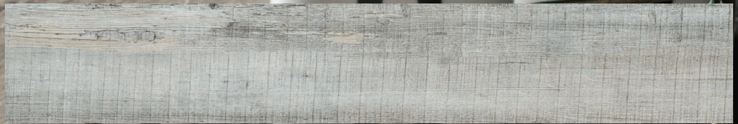
EMBER (Grey) 8" x 48" Matte KM.NN.EMB.0848.MT