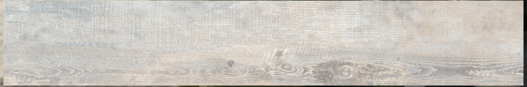
DAYLIGHT (White/Ivory) 8" x 48" Matte KM.NN.DAY.0848.MT