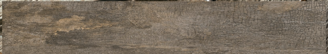
BURNET (Brown) 8" x 48" Matte KM.NN.BNT.0848.MT