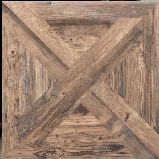
SUN (Dark Beige) 60 x 60 cm (23.63 x 23.63) RF.BT.SUN.2424

Not all items shown in this document are part of Alpha's stocking program and are pulled from Olympia Tile. For special orders, please contact your Alpha Tile Sales Representative.