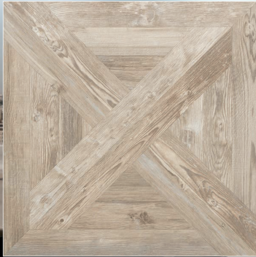
NATURAL (Beige) 60 x 60 cm (23.63 x 23.63) RF.BT.NAT.2424