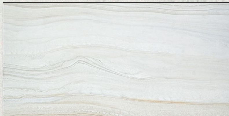
LIGHT BEIGE 29.7 x 60 cm (12 x 24) Matte Finish YS.TL.LBG.1224.MT