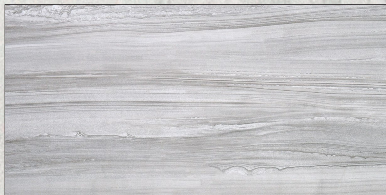
LIGHT GREY 29.7 x 60 cm (12 x 24) Matte Finish YS.TL.LGR.1224.MT