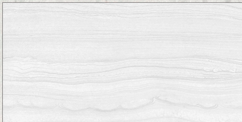
WHITE 29.7 x 60 cm (12 x 24) Matte Finish YS.TL.WHT.1224.MT