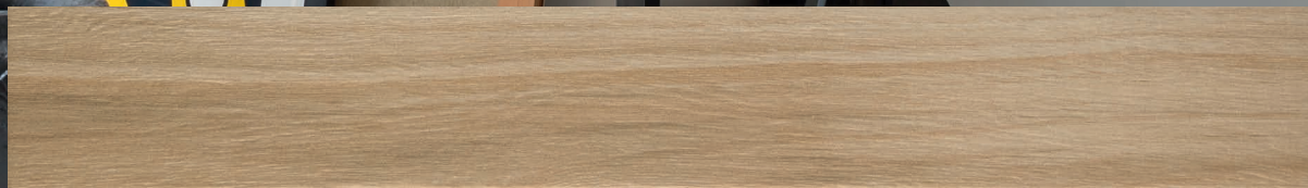
NEUTRAL (BEIGE) 4 x 28 Matte MZ.TF.NTR.0428