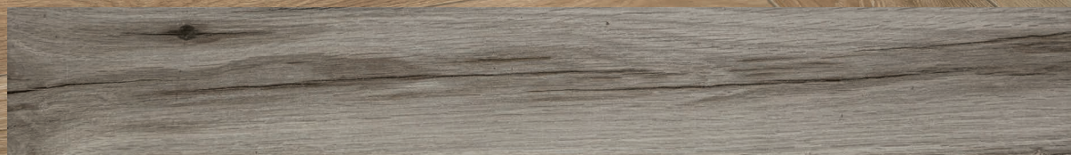
GREY 4 x 28 Matte MZ.TF.GRY.0428