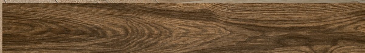
BROWN 4 x 28 Matte MZ.TF.BWN.0428