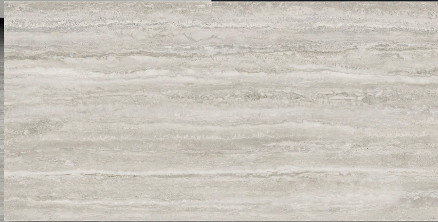
ARGENTO - Matte 30 x 60 cm (12" x 24") Code # KJ.TR.ARG.1224

Not all items shown in this document are part of Alpha's stocking program and are pulled from Olympia Tile. For special orders, please contact your Alpha Tile Sales Representative.