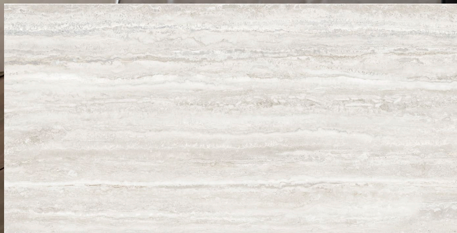
BIANCO - Matte 30 x 60 cm (12" x 24") Code # KJ.TR.BIA.1224