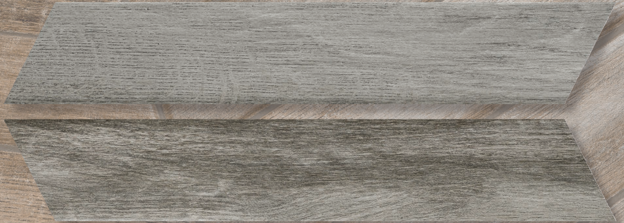
CENDRE (Grey) 3" x 16" RD.VT.CEN.0316