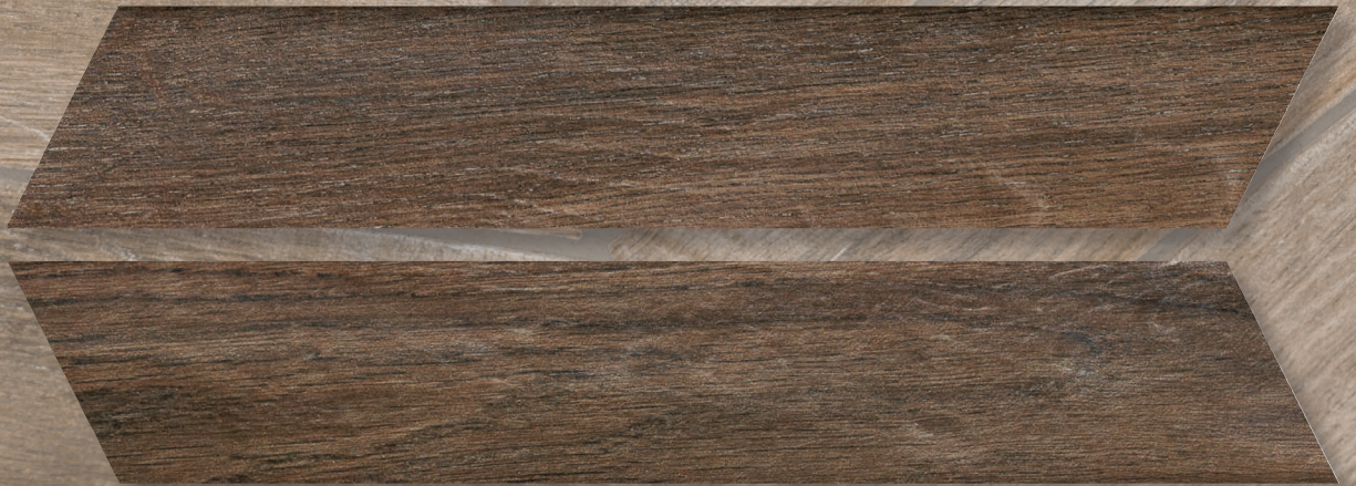
BRUNE (Brown) 3" x 16" RD.VT.BNU.0316

Not all items shown in this document are part of Alpha's stocking program and are pulled from Olympia Tile. For special orders, please contact your Alpha Tile Sales Representative.