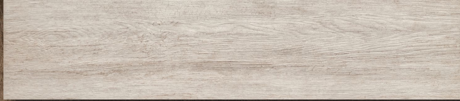
STUCCO 20 x 90.5 cm (8 x 36) Natural Finish PAN 8X36 WYST

COLORED-BODY GLAZED STONEWARE MADE IN USA