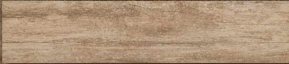
DOLCE 20 x 90.5 cm (8 x 36) Natural Finish PAN 8X36 WYDO