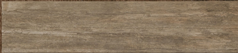
CORDA 20 x 90.5 cm (8 x 36) Natural Finish PAN 8X36 WYCO

All items shown in this document are part of Alpha's stocking program. For special orders, please contact your Alpha Tile Sales Representative.