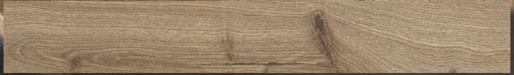
BEIGE 10 x 70 cm (4 x 28) MZ.WE.BGE.0428