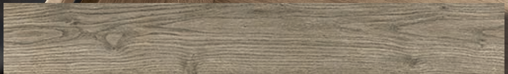
BROWN 10 x 70 cm (4 x 28) MZ.WE.BWN.0428