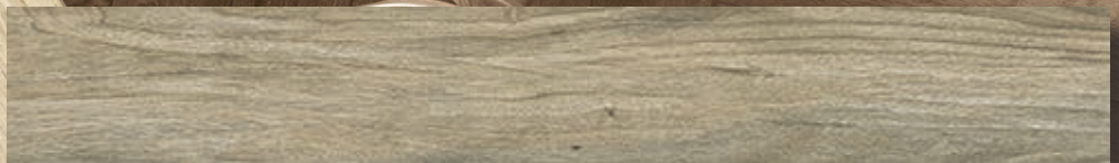
HONEY 10 x 70 cm (4 x 28) MZ.WE.HNY.0428

All items shown in this document are part of Alpha's stocking program. For special orders, please contact your Alpha Tile Sales Representative.